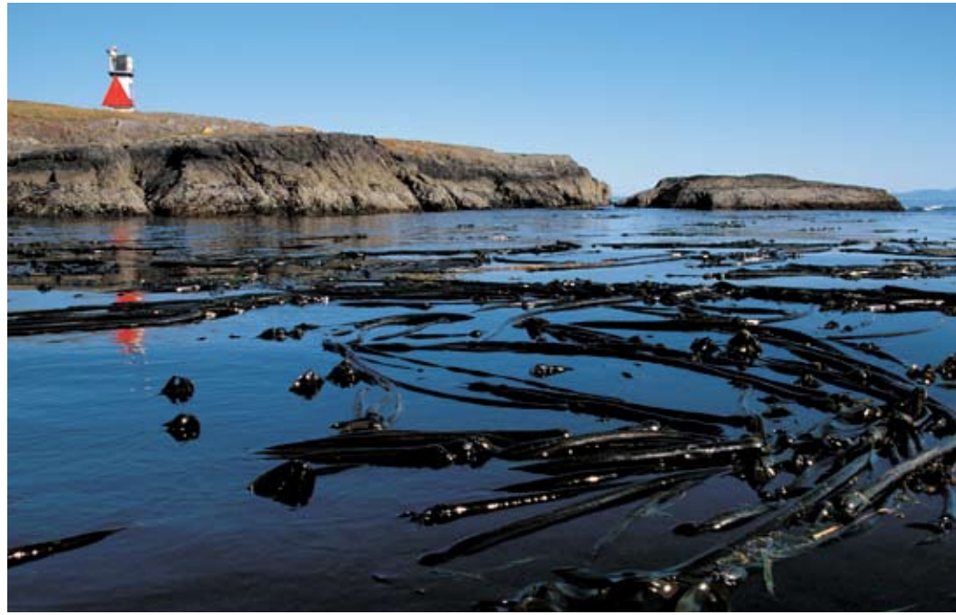
In 2007, FRIENDS mapped San Juan County's critical bull kelp habitat.

FRIENDS has recently completed a county-wide mapping project of bull kelp ( Nereocystis luetkeana ) in partnership with the Washington Department of Natural Resources. The location of this important habitat is now documented along 78 miles of shoreline in the San Juans. Project