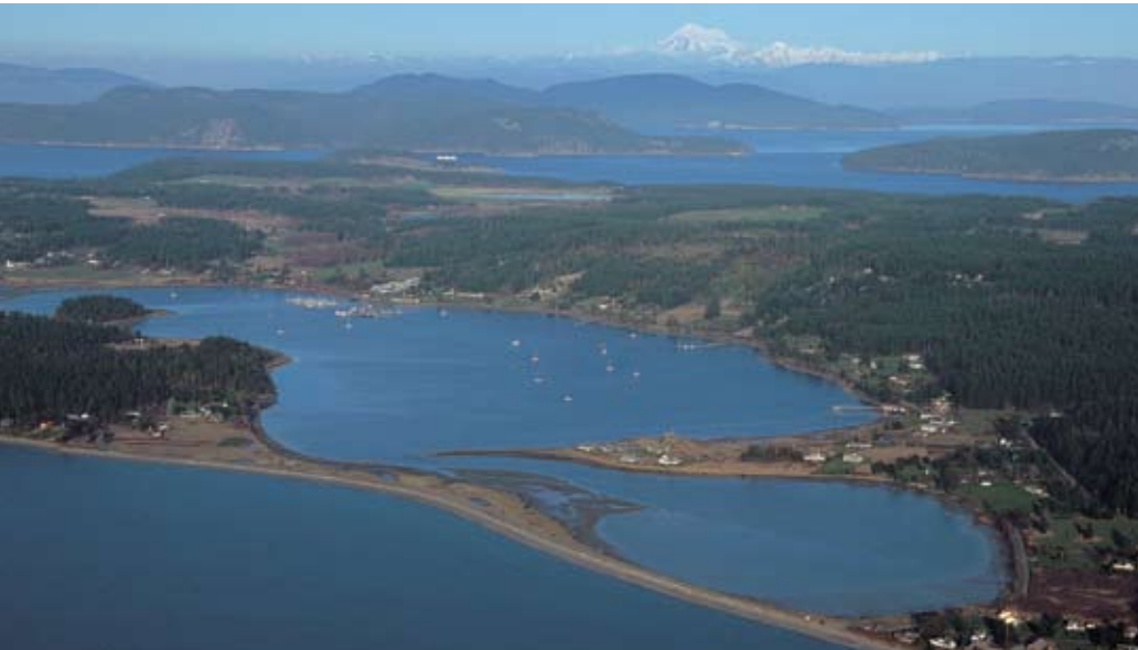
Lopez citizens work with FRIENDS to protect Fisherman Bay shoreline.

Protecting our local resources requires the collective efforts of many caring islanders. FRIENDS assists individuals, neighborhoods, committees, and organizations to increase their capacity to protect environmental resources and preserve the livability and character of the islands. FRIENDS also participates with local citizens on numerous volunteer advisory committees.