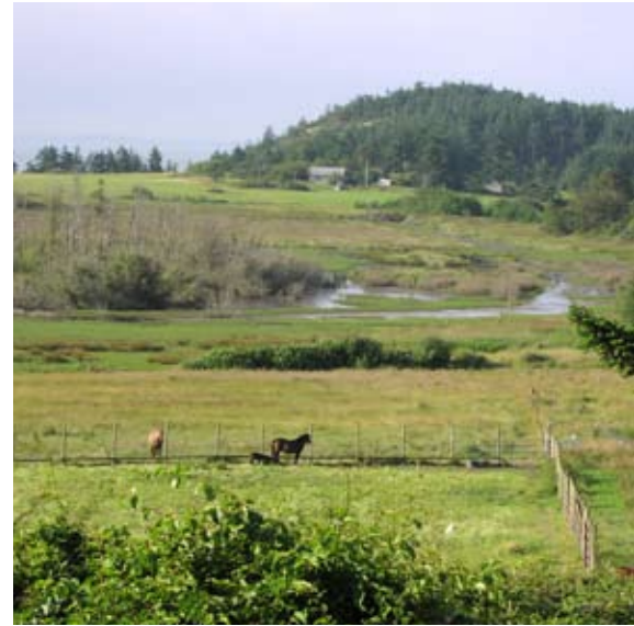
FRIENDS policy work in 2007 aimed to protect fresh water, shoreline, and upland resources.

decisions. The second section includes community choices on how to approach the regulation of critical areas.