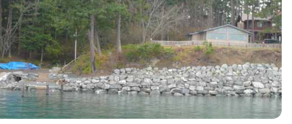
Conservationists and developers agree that San Juan County's code enforcement ordinance needs to be revised. After 10 years of waiting, a new ordinance is lingering with the planning commission.