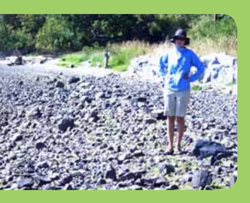
Before: The bulkhead along the road has made thi: beach unsuitable for smelt to spawn.