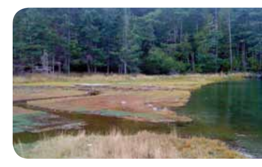
After: The marsh now improves water quality, vegetation and fish passage.