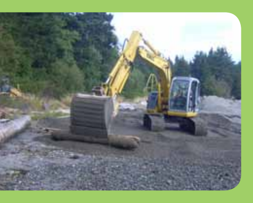
After: The addition of sand and gravel has created a healthy forage fish spawning beach.