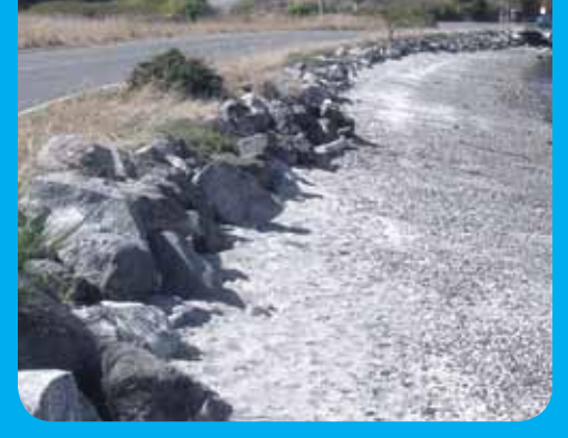
After: Forage fish spawning habitat zone (roughly the shell hash line) is now free of large rock.