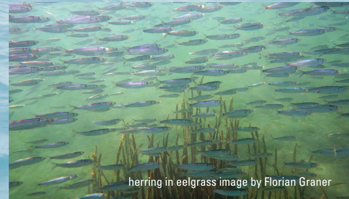
herring in eelgrass