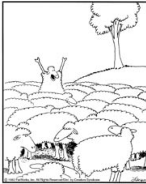
“Wait! Wait! Listen to me! ... We don't have to be just sheep!”