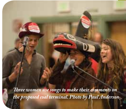
Three women use songs to make their comments on the proposed coal terminal.