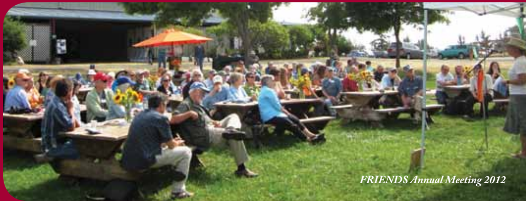
FRIENDS Annual Meeting 2012