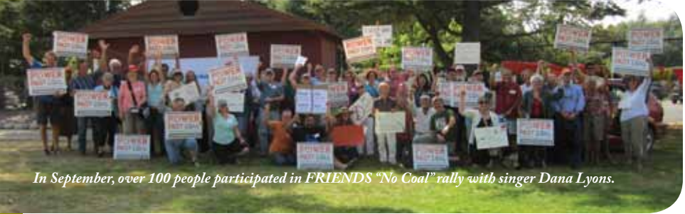
In September, over 100 people participated in FRIENDS "No Coal" rally with singer Dana Lyons.

Mining companies plan to strip mine coal in Montana and Wyoming and transport it by train to Washington and Oregon, where it would be loaded onto massive cargo ships bound for Asia. The Gateway Pacific Terminal (GPT) has been proposed for Cherry Point, near Bellingham, to export 48 million tons of coal a year. Approximately 487 cargo ships of coal would add nearly 1000 vessel trips through our waters each year.