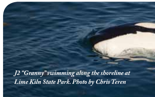
J2 "Granny" swimming along the shoreline at Lime Kiln State Park.